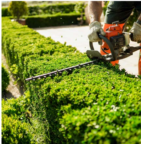
Operation & Maintenance